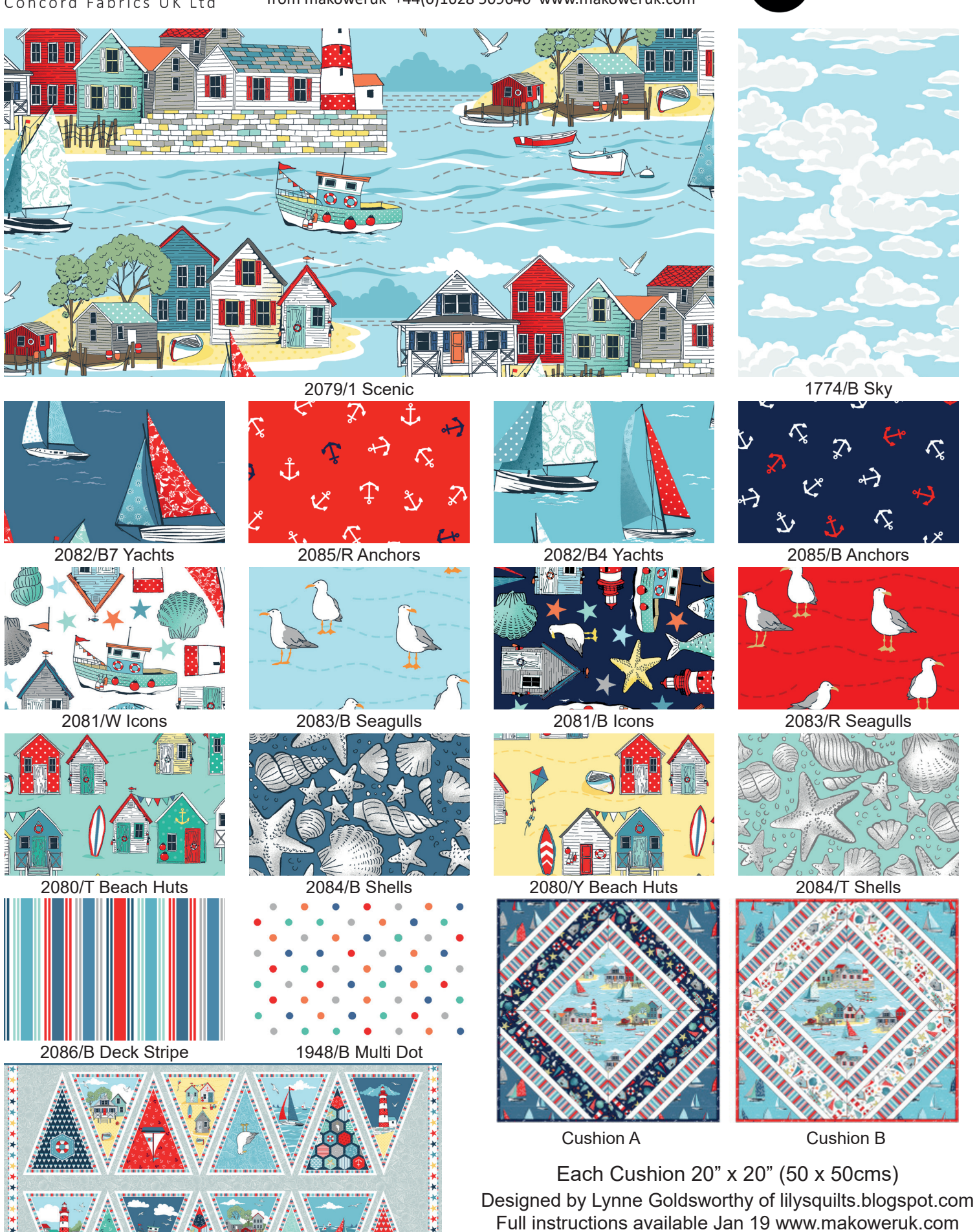
2087/1 Bunting Panel Actual Size 24" x 44" (60 x 115cms)